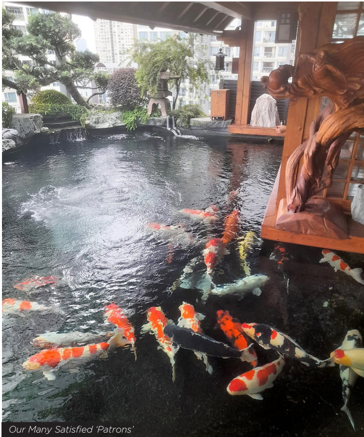
Our Many Satisfied 'Patrons'