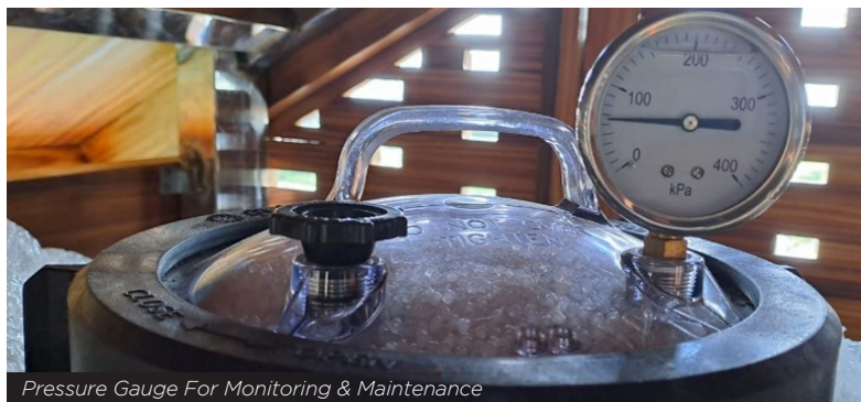
Pressure Gauge For Monitoring & Maintenance

Designed specifically for ponds and water gardens, the Aquabiome filter offers both mechanical and biological filtration within one unit. With its capability to support vast nitrifying bacteria populations, it stands out for its reliability and ease of maintenance, making it ideal for high-density recirculation systems. Its structure is optimized for maximum water flow, ensuring efficiency, and is built with the latest fibreglass winding technology, offering UV stabilization and corrosion resistance for