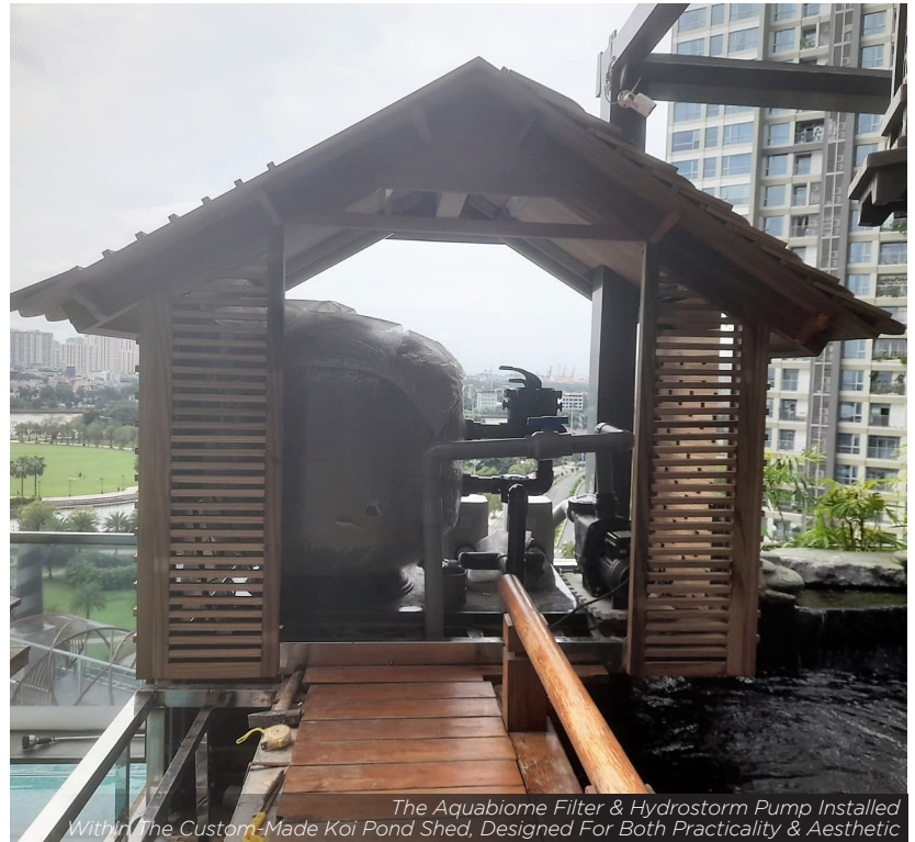
The Aquabiome Filter & Hydrostorm Pump Installed Within The Custom-Made Koi Pond Shed, Designed For Both Practicality & Aesthetic