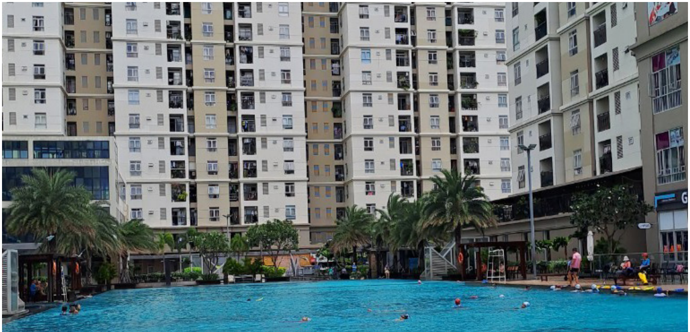
Ho Chi Minh City's largest swimming pool, a serene oasis amidst urban living