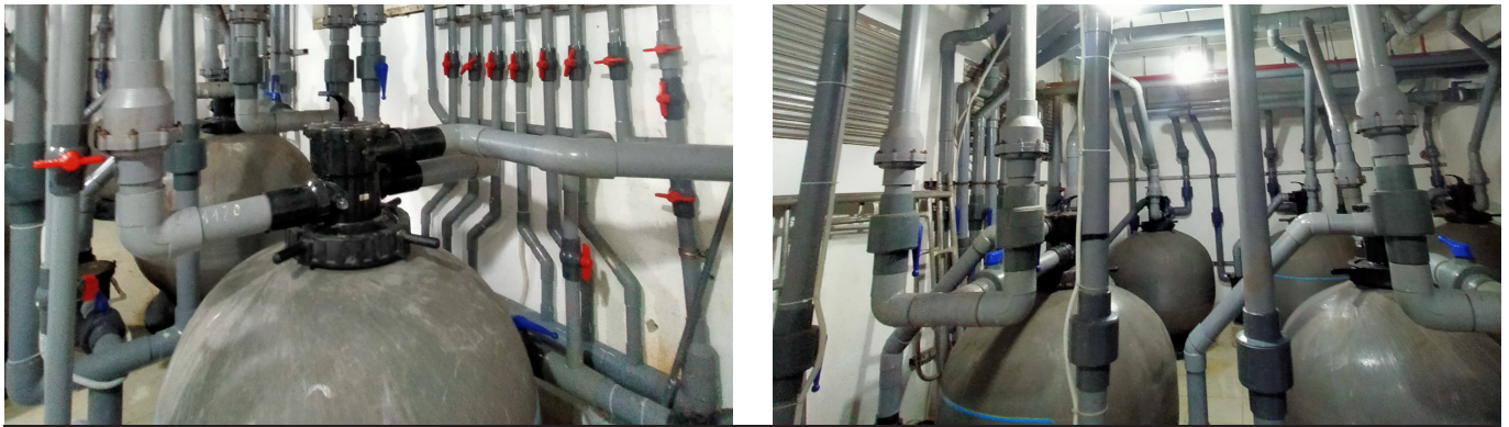
Precision in Every Pipe: The meticulously designed and carefully planned filter and pump system at the Anh Vien Swimming Pool ensures optimal performance and maintenance efficiency

The pump room being located lower than the pool presented unique challenges and opportunities for the installation. This positioning allowed for a gravity feed, which enhanced the pump's efficiency by reducing its workload. However, it required careful planning to ensure proper water flow control and prevent backflow. The piping configuration was meticulously designed to accommodate the height difference, ensuring smooth and efficient operation. Special flow control mechanisms were implemented to manage these factors effectively. Additionally, the compact design of Waterco's products facilitated a smooth installation process in the space of the lower-level pump room, ensuring easy access for future maintenance.