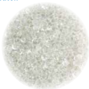
Glass Pearl Media