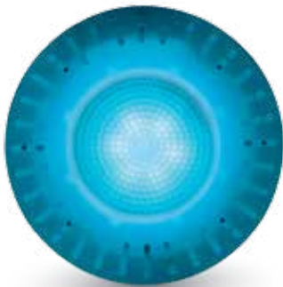
BriteStream LED lights utilizes energy efficient super bright LEDs and now integrates the new BritelLux diffuser Lens.

Sensitive Choice® blue butterfly recognises products and services that support asthma and allergy care.