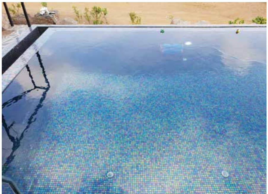
A chlorine free, oxygen enriched swimming pool that’s soft and gentle on the skin. No shower required after swimming. Just like a refreshing swim in a natural spring.

In fact, without needing any costly or time-consuming modifications, Hando was able to easily install the following Waterco products: