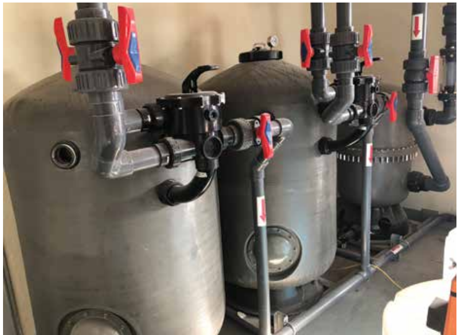
Micron fibreglass filters embody the latest in fibreglass winding technology.