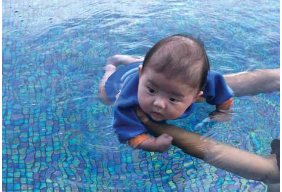
Great news for swimmers! The Hydroxypure system is the only water sanitisation system, which is endorsed by the National Asthma Council of Australia and approved for inclusion in its Sensitive Choice® program.

Thanks to Waterco, Man in Aewol Resort guests can now enjoy crystal clear pool water throughout the year, while maintenance staff can spend more time attending to the lush gardens than cleaning the pool.