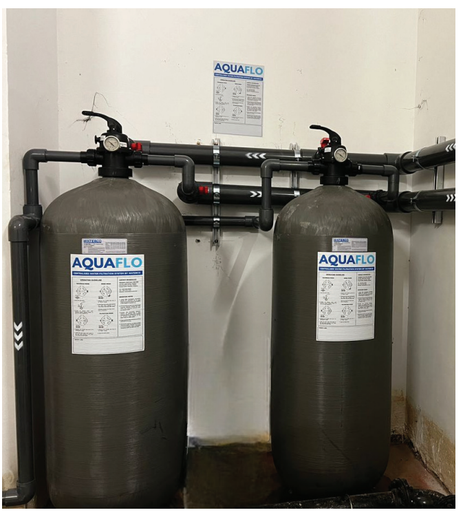
Aquaflo Filtration System in Action: The AQ600X units at Mercure Hotel, designed to improve water quality and reduce internal equipment strain

Despite some initial challenges, the installation of the Aquaflo filter system was executed seamlessly with